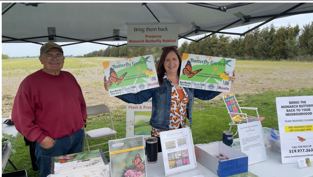
GL Brewing Co. Farmers Market Amherstburg ON May 2023