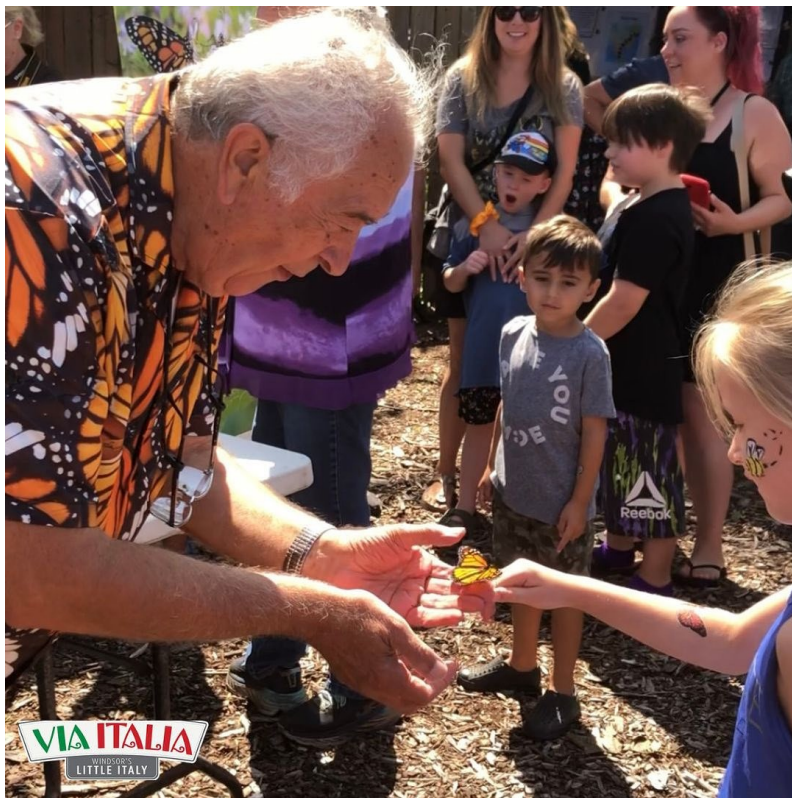
Releasing Monarch Butterflies at our Annual Butterfly Festival in Windsor ON