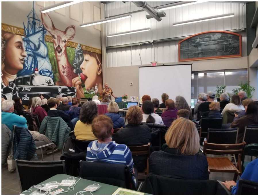
LaSalle Horticultural Society April 2023