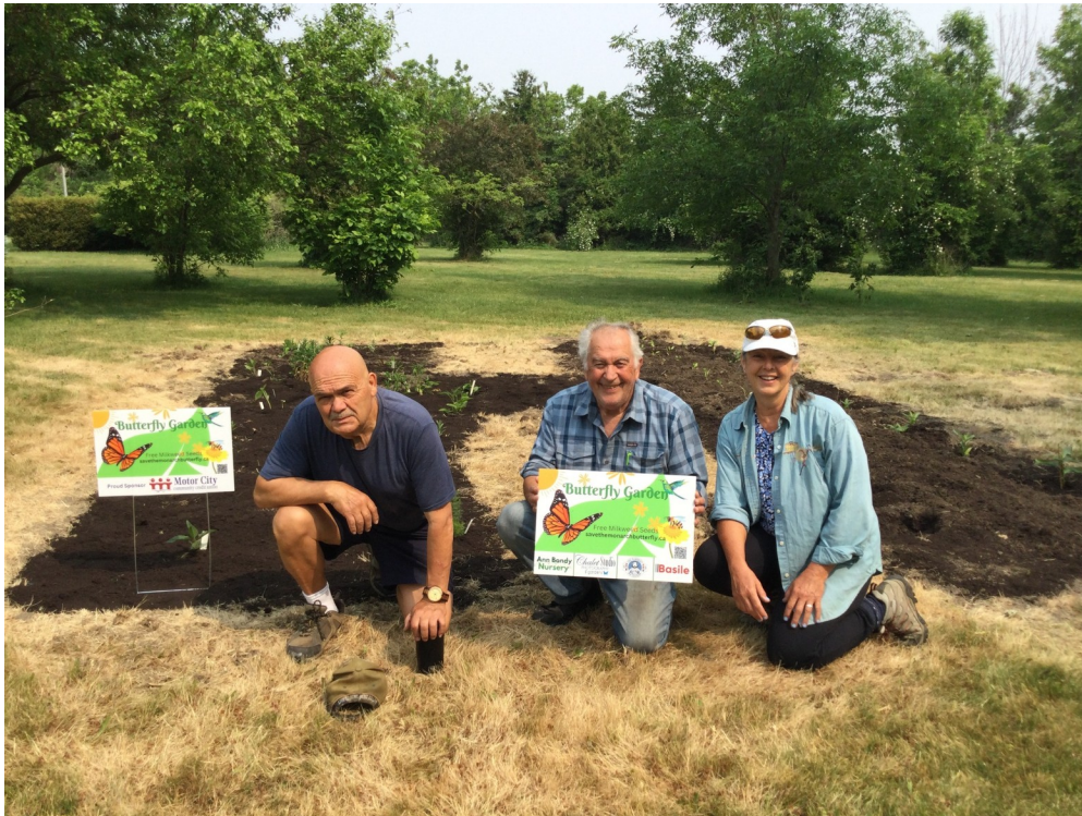
Planting a Pollinator Garden at Jack Miner. Kingsville ON June 2023