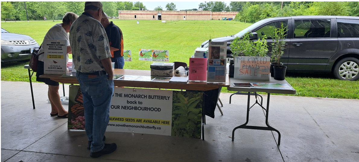
Canadian Automotive Museum Butterfly Festival Kingsville ON July 2023