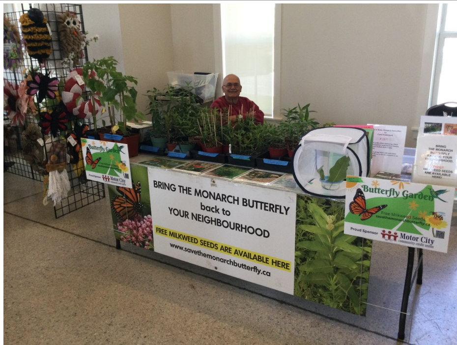
Kingsville ON Native Plants Sale May 2023