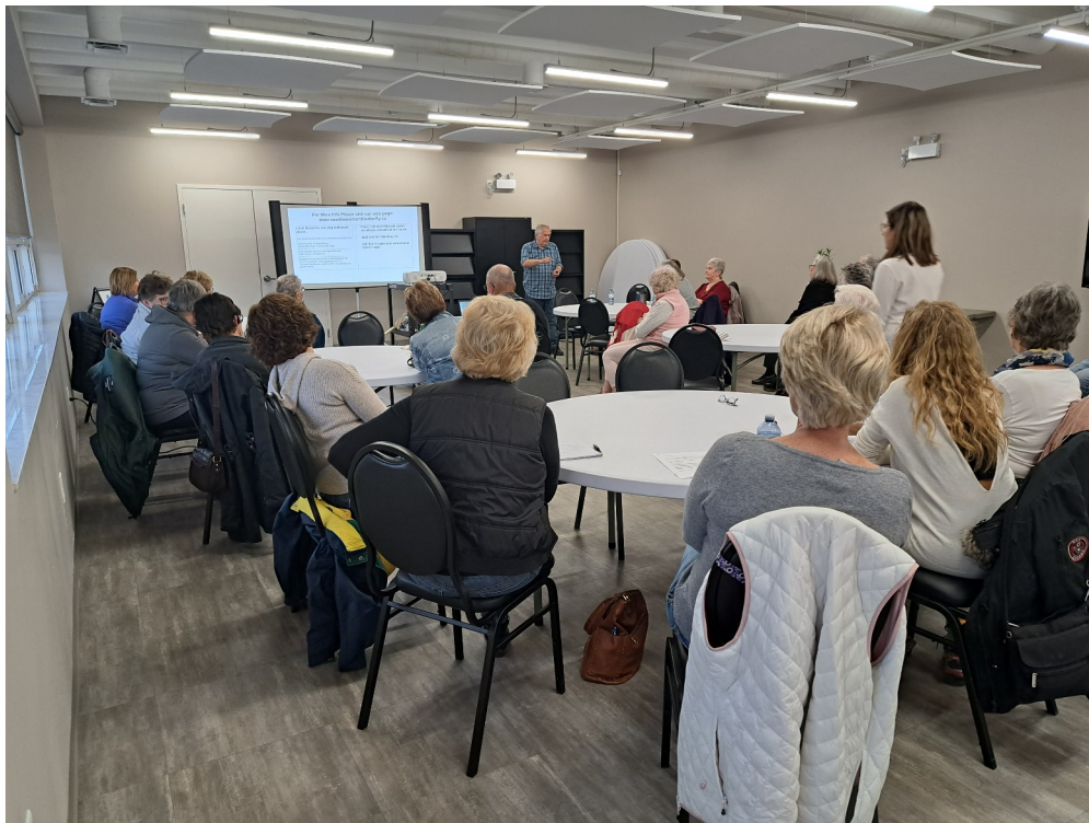
Amherstburg Horticultural Society April 2023