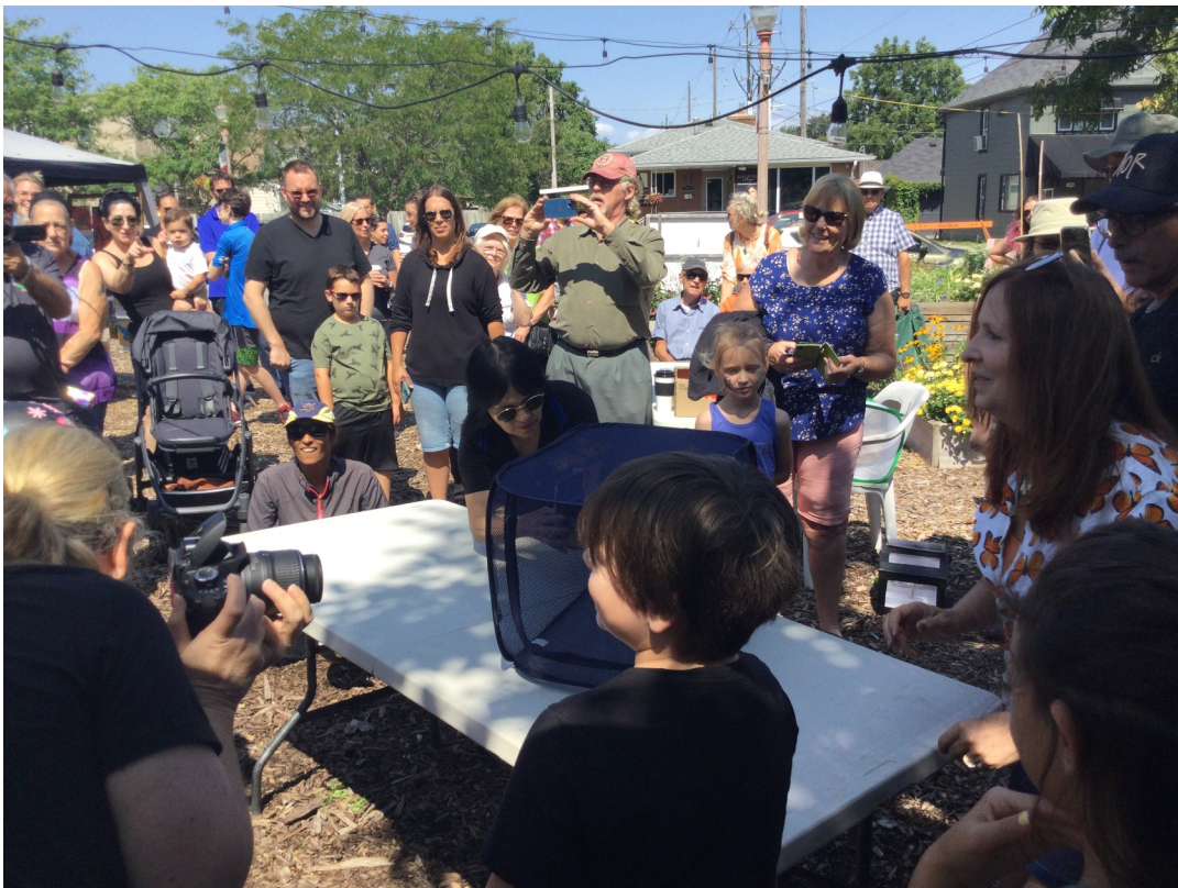
Butterfly Festival Windsor, ON August 2023