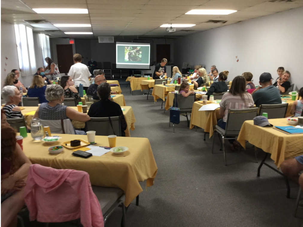
Egg to Butterfly Workshop May 2022