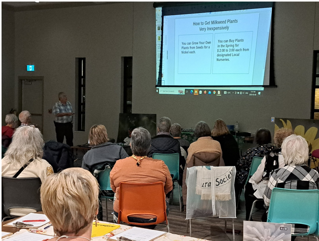
Greater Windsor Horticultural Society Windsor ON March 2023