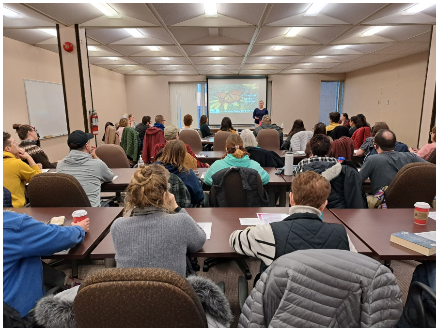
Essex ON Hosted by E.R.C.A Feb 2023