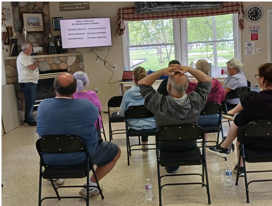
Lake Erie Country Club Amherstburg ON May 2023