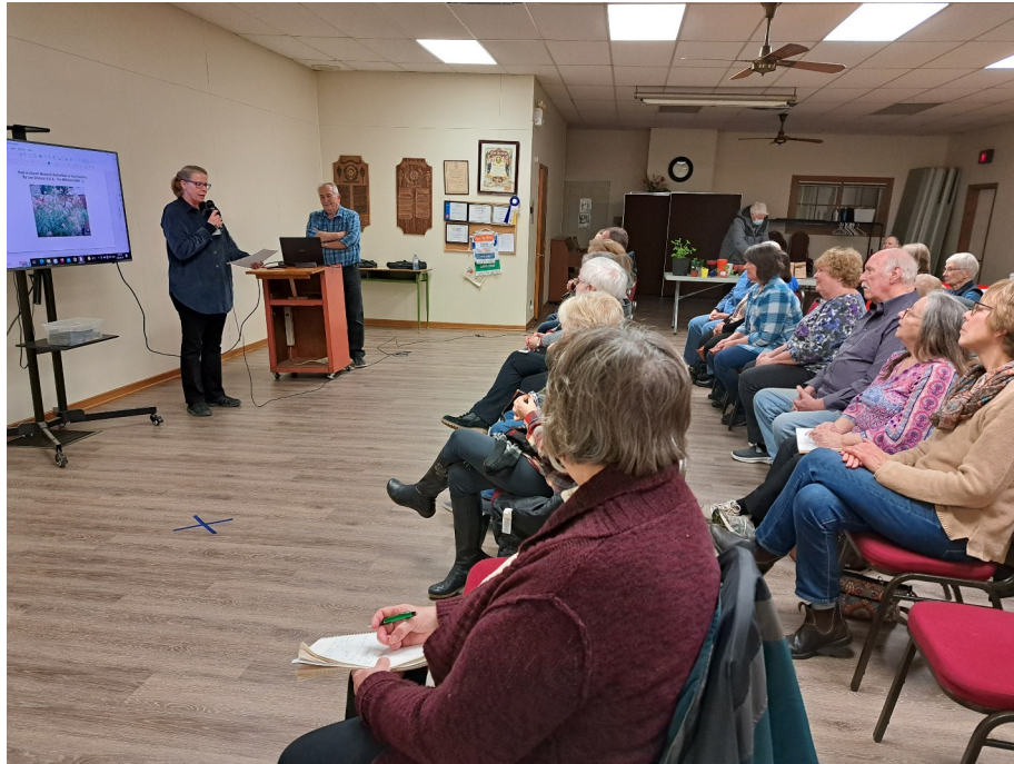
Ridgetown Horticultural Society February 2023