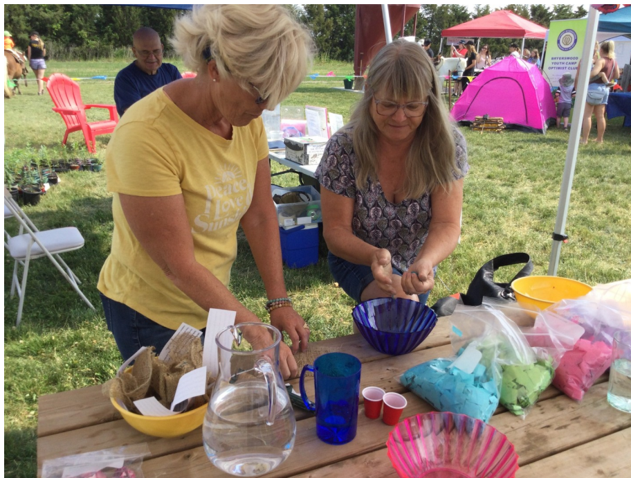
GL Brewing Co. July 2023