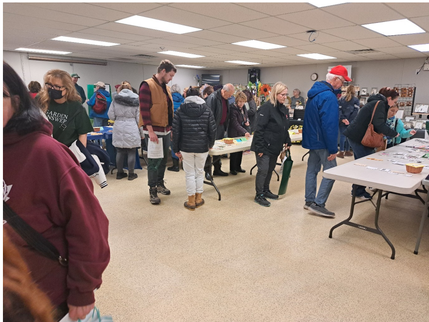
Seedy Saturday Essex ON March 2023