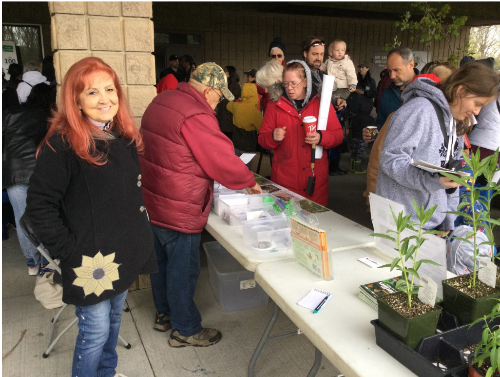
Earth Day Event at Malden Park Windor ON April 2023