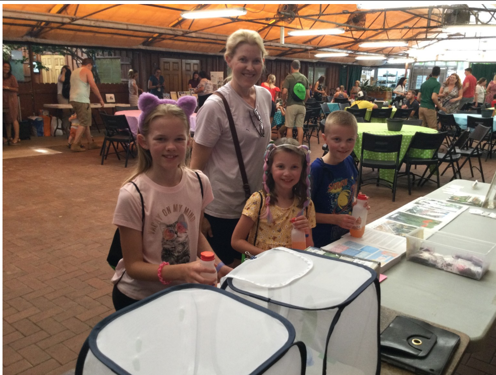
Free Milkweed Seeds and Raising Monarch Workshop at Colasanti, Kingsville ON July 2023