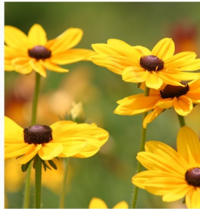
Black Eyed Susan